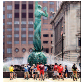
Interns with Summer on the Cuyahoga, a Community Impact Award recipient, visit the War Memorial Fountain in Cleveland.

For information, visit www.dom.com . Search: eBill .